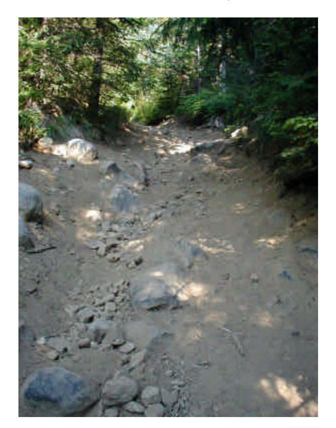
Photos 7 & 8, Goat Mtn. OHV Trails showing typical erosion patterns.