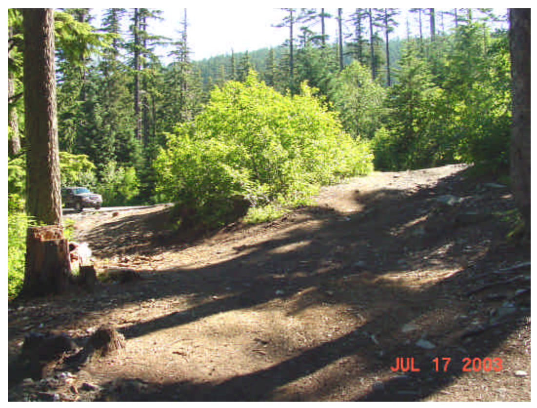
Photo 5: Helens Lake Entrance to shore area with tree damage, bare soil and erosion channels.