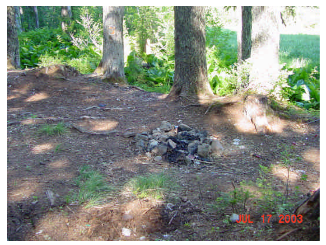
Photo 6: Helens Lake Shore area with unauthorized fire ring, litter and bare soil

Goat Mountain OHV Trails - Off Highway Vehicles, ranging from motorcycles to full size 4X4 trucks and SUVs, have been used to create a network of unplanned and unauthorized recreational use trails in Section 14 (with some trails extending into adjacent sections). Approximately three miles of these unauthorized trails have been identified so far. The denuded and compacted soil on steep slopes is eroding and introducing sediment into streams. Other trails may be created, or discovered, in the vicinity of the project area between the time of analysis and implementation and would be included in the scope of this analysis. Land Use Allocations include: Matrix, Riparian Reserve, and potentially an Area of Critical Environmental Concern.