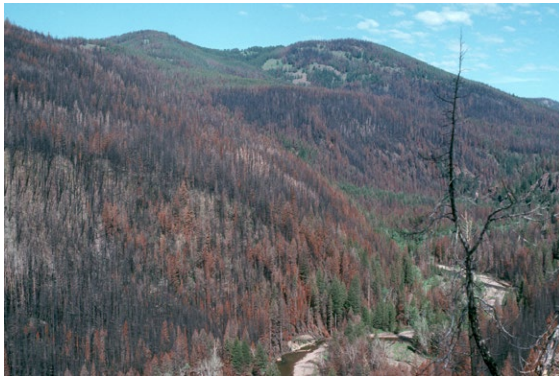
Fig. 2. Mixed-severity fires (fires that leave recognizable patches of low-severity, medium-severity, and high-severity effects) typify the majority of mixed-conifer forest systems in the western United States. The brown-needled and blackened areas harbor unique sets of plant and animal species found in no other forest conditions. This photograph of the North Fork of the Blackfoot River was taken 10 months after the 1988 Canyon Creek fire in Montana. Many fire-dependent plant and animal species were present in the more severely burned areas until they were helicopter logged, suggesting that unburned forests might be a better alternative for timber harvest.